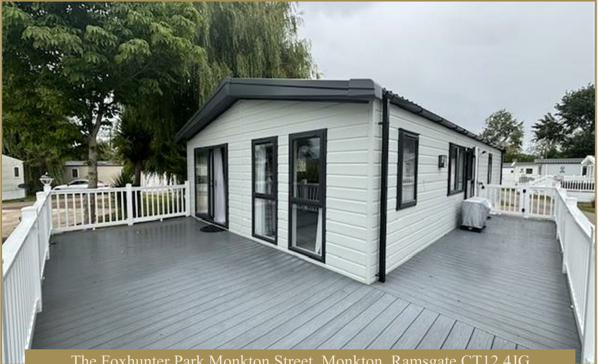
The Foxhunter Park Monkton Street, Monkton, Ramsgate CT12 4JG